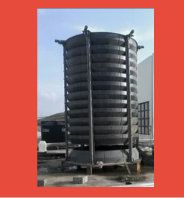
FRP Fanless Induced Draft Whirljet Cooling Tower