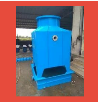
Fiberglass Cooling Tower