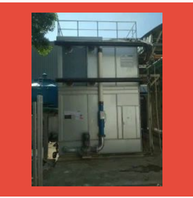
Closed Loop Cooling Tower