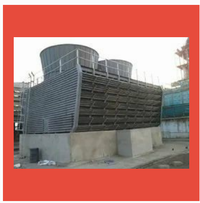
Cross Flow Cooling Tower