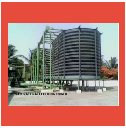
Natural Draft Cooling Towers