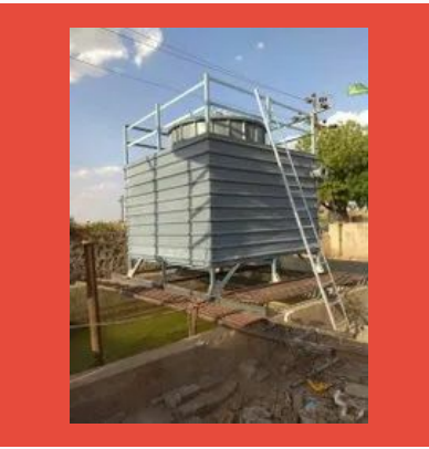
Forced Draft Cooling Tower