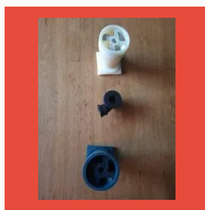
Cooling Tower Nozzle