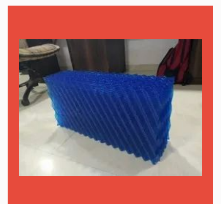
Honeycomb Pvc Fill