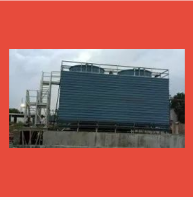
Twin Cell Pul FRP Cooling Tower