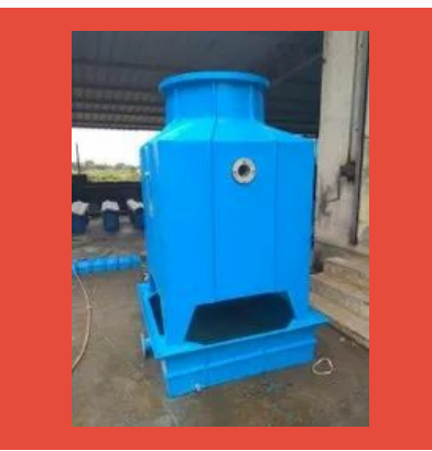
Frp Water Cooling Tower