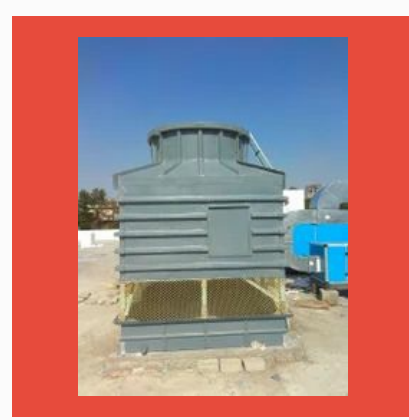
Frp Single Cell Cooling Tower