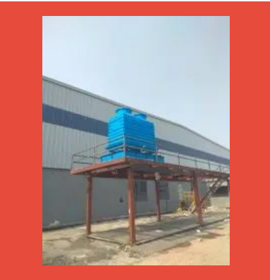
Package Cooling Tower Twin Cell