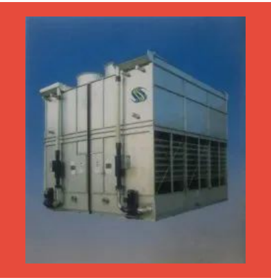
Closed Circuit Cooling Tower