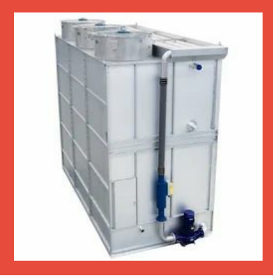
Coil Evaporative Condenser