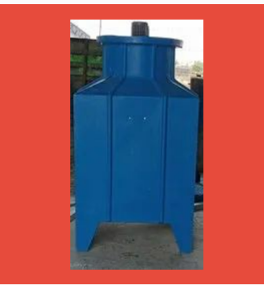
Assembled Cooling Tower