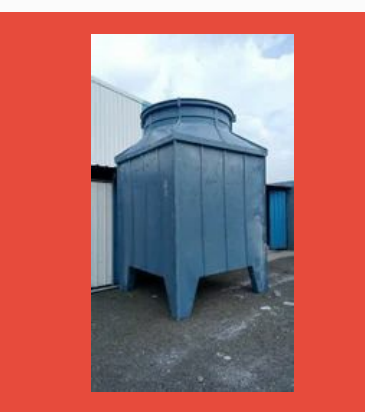
Packaged Cooling Tower