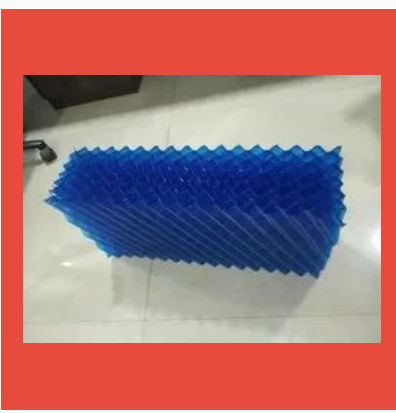
Abs Cooling Tower Fills