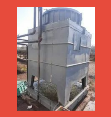
Water Cooling Tower